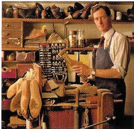
A cobbler at John Lobb