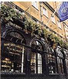
Berry Bros. & Rudd