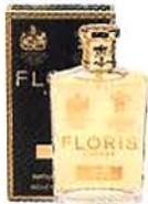
Fragrance from Floris

ESTABLISHED 1854 ◦ Sit down for a straight-razor shave or load up on vintage-inspired shaving gear. 74 Jermyn St., www.tayloroldbondst.co.uk