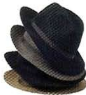
Fedoras from Lock & Co.

ESTABLISHED 1859 ◦ England's best-known and most elegant