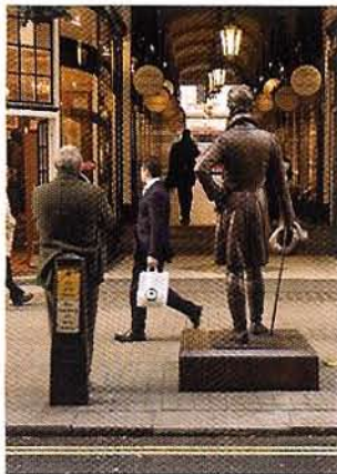
Burlington Arcade, a covered thoroughfare off Jermyn Street

→ You know how women get all gaga about going to Tiffany's when they're visiting New York? Or Rodeo Drive when they're in L.A.? If you're a guy (and we're going to go ahead and assume you are) and you're in London, then you'll need to get yourself to where Jermyn and St. James's Streets converge, a short jaunt from Savile Row. It's not trendy. It's not design-savvy. It's old-school English. Exactly what you won't find back home.